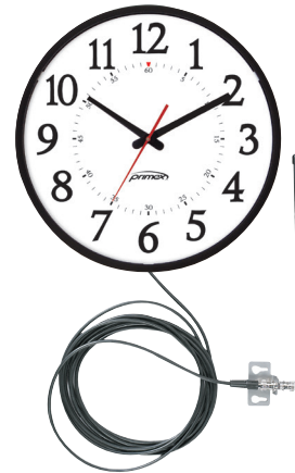
Remote Antenna Clock

To Learn More: Call 800.537.0464 Email: info@primexinc.com