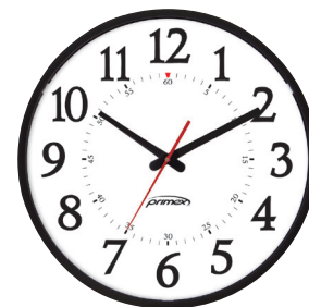
12.5" or 16" Traditional Series