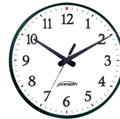
9" Traditional Series