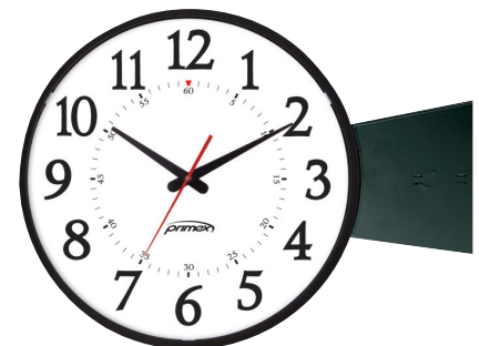
12.5" Dual-Sided Traditional Series